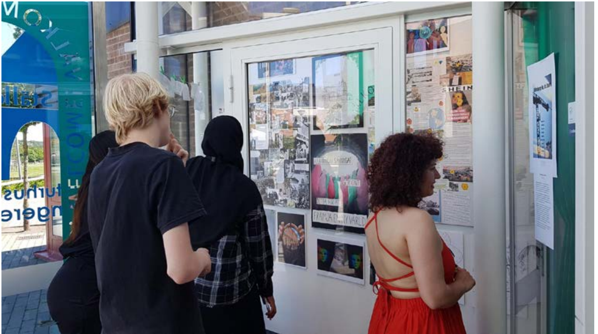
Installation view of exhibition