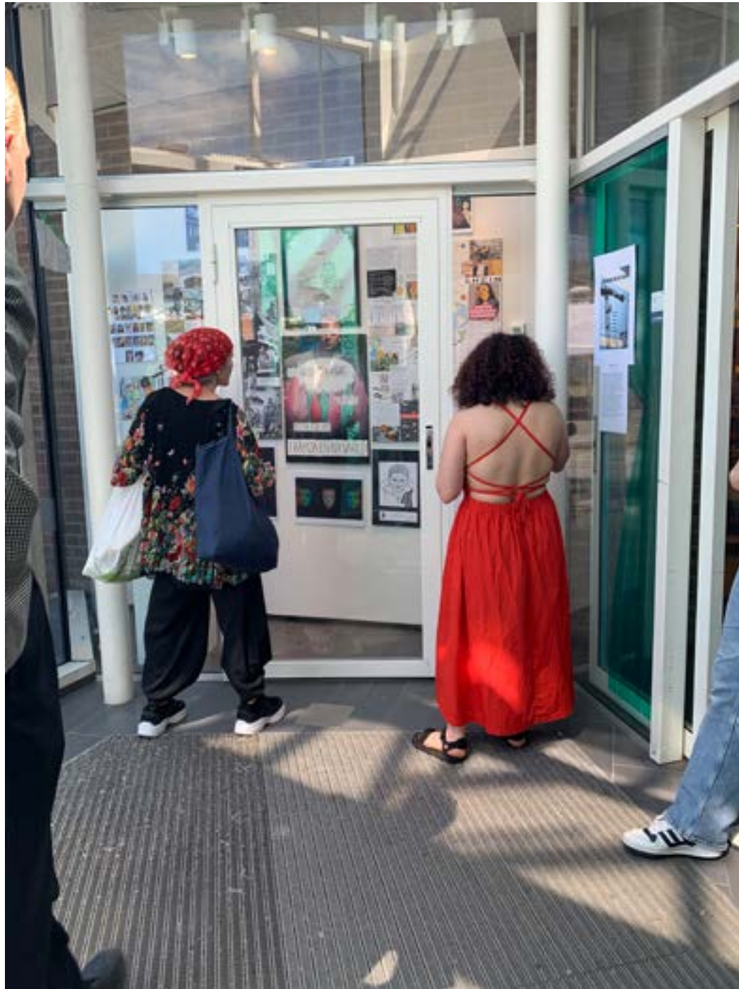
Installation view of exhibition