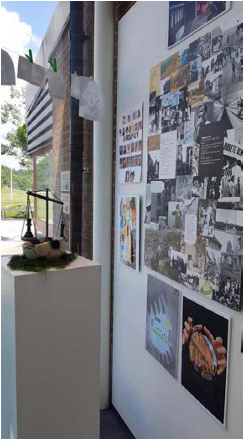
Installation view of exhibition