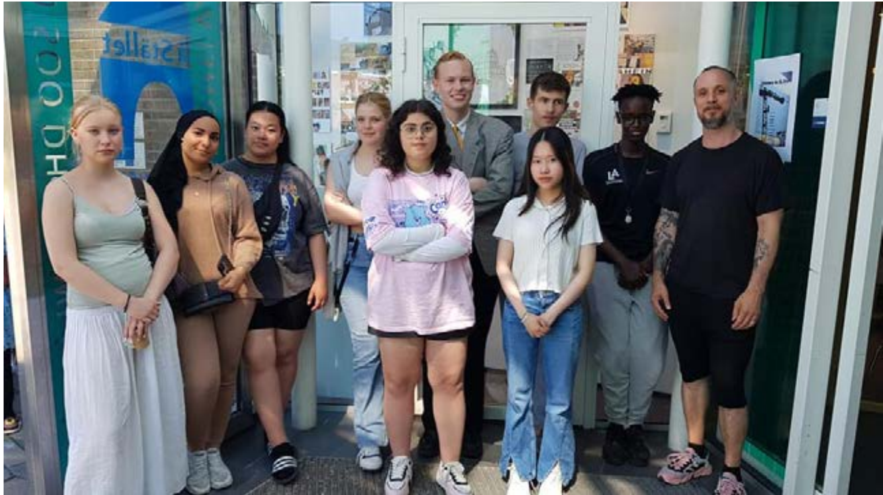
So grateful to have had the opportunity to work together with these amazing and brilliant young individuals.